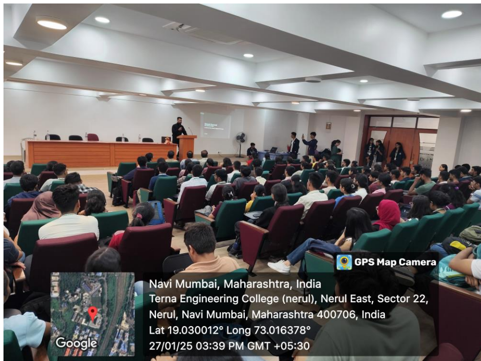
LinkedIn & Resume Building Seminar