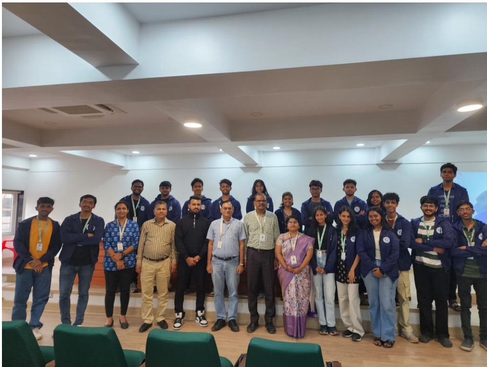
CSI Body (2024-2025)

The CSI Terna Chapter Inauguration (2024-2025) marked the introduction of the newly appointed committee, committed to fostering technical excellence and community engagement. The new team aims to organize workshops, seminars, and networking events to enhance students' skills and industry readiness. The event also included a certificate distribution ceremony to recognize the efforts and contributions of the 2023-2024 CSI committee members, appreciating their dedication and impactful initiatives. This inauguration set the stage for an exciting year ahead, promoting innovation,